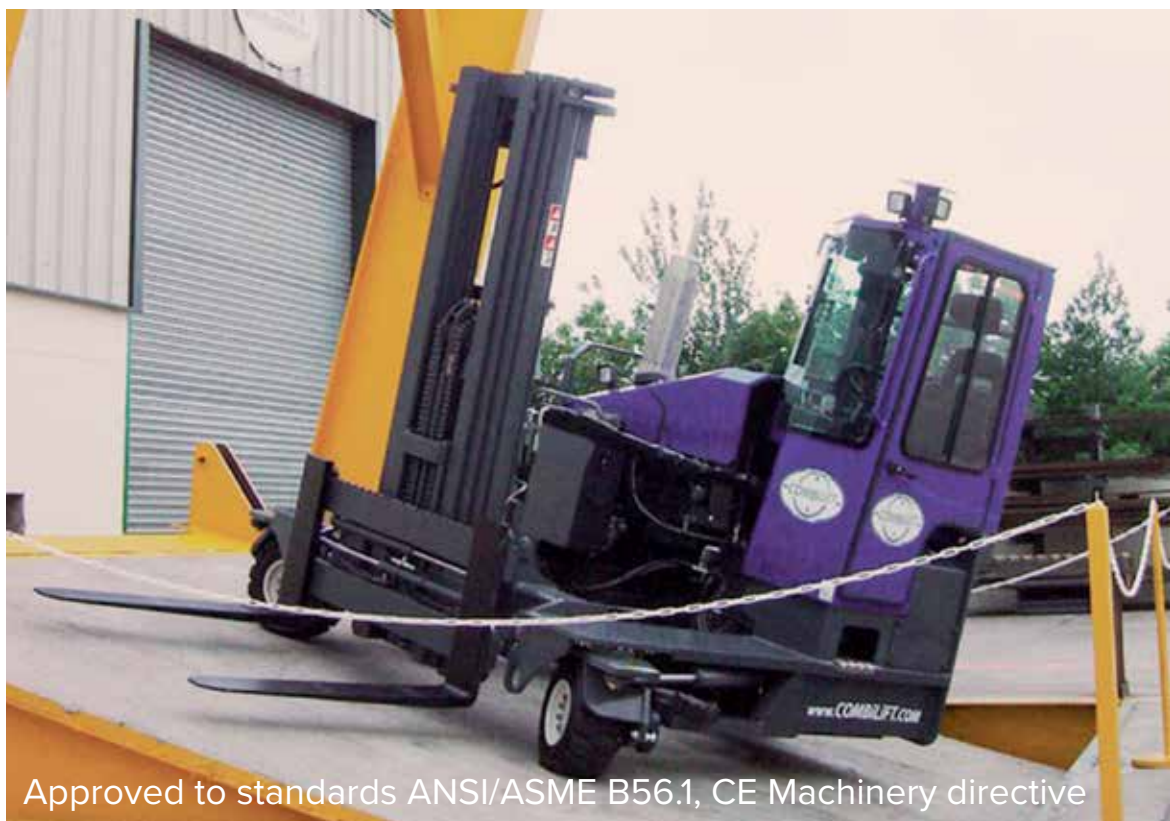
Approved to standards ANSI/ASME B56.1, CE Machinery directive

saving and productive handling and storage, and it is now the acknowledged leading manufacturer and innovator in its sector worldwide